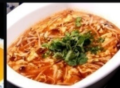
S006 Beijing Hot and Sour Soup 京都酸辣汤 £ 4.50