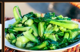
🌿 K017 🌿 Pak Choi 小棠菜 9.50