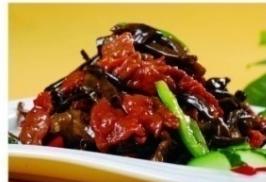
D006 Stir Fried Sliced Beef with Tea Tree Mushroom, Chopped Green Chilli & Spring Onion 茶树菇牛肉 ¥ 9.50