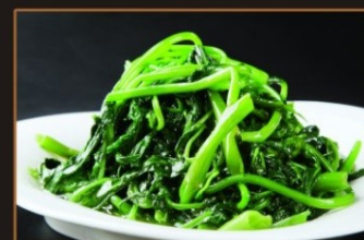
🌿 K016 🌿 Tong Choi 通菜 9.50