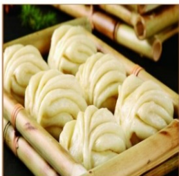
L002 Beijing Style Steamed Twisted Rolls (3 pieces) 京味花卷(每份3个) ¥ 4.50