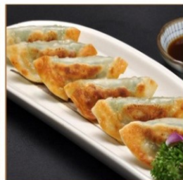
L003 Guotie Pan Fried Beijing Style Mince Pork Dumplings (6 pieces) 京味锅贴(每份6个) ¥ 5.80