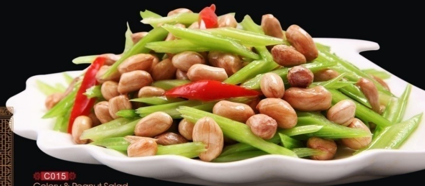
C015 Celery & Peanut Salad 爽口西芹丝 € 5.50

Vegetarian Vegetarian Option All prices include VAT 餐牌價錢已包含VAT