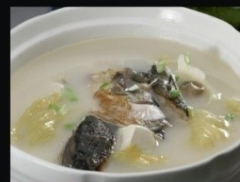
S001 Sliced Fish & Beancurd Soup 鱼片豆腐汤 £ 4.50

Banquet menus and dishes available will vary seasonally, please let us know your likes and dislikes. 套餐中的菜式仅为范例，我们将按不同季节而供应最受欢迎的时令菜， 请告诉我们你喜欢和忌口的菜式。