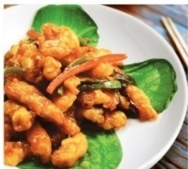
G017 Stir Fried Pangansun Fish Fillets with Green & Red Pepper 辣子白鱼条 9.50