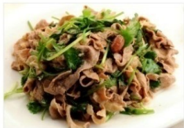
D003 Hot Wok Sliced Mutton with Coriander 芫爆羊肉 ¥ 9.50