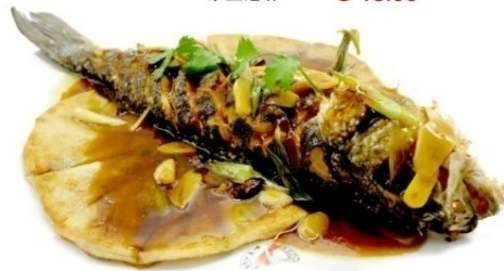
G015 Pan Fried Sea Bass in Sauce Served with Fried Bread 鲈鱼泡饼 18.00