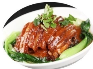
E008 Braised Sliced Pork Belly with Preserved Cabbage 冬菜扣肉 $ 9.50