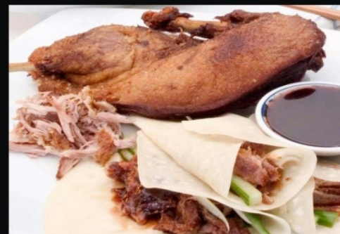
Aromatic Crispy Duck (Served with Shredded Cucumber, Spring Onion, Hoi-sin Sauce & Pancakes) 香酥鸭

Vegetarian Vegetarian Option All prices include VAT 餐牌价钱已包含VAT