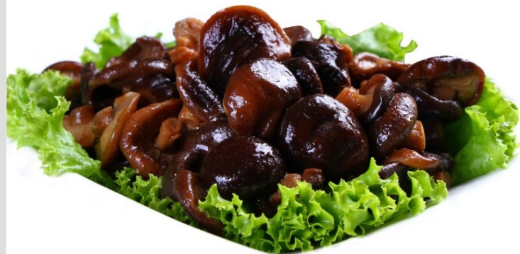
🌿 K009 🌿 Braised Mushroom in Gravy 🌿 油焖香菇 9.50