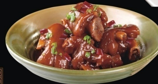
E005 Braised Pig Feet in Hot Spicy Sauce (with Bones) 香辣猪手 ¥ 9.50