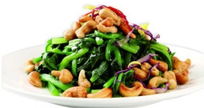
C011 Spinach with Cashew Nuts 腰果菠菜 € 6.50