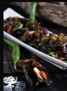
C016 Black Fungus with Crushed Garlic 蒜香黑木耳 € 5.50