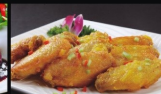
B008 Salt & Pepper Chicken Wings 椒盐鸡翅 7.50