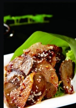
C002 Hot & Spicy Sliced Beef £ 6.50 麻辣牛肉