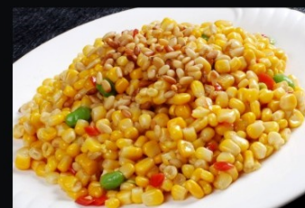
K007 Stir Fried Sweet Corn & Baby Corn with Pine Kernel 松仁玉米 ¥ 9.50