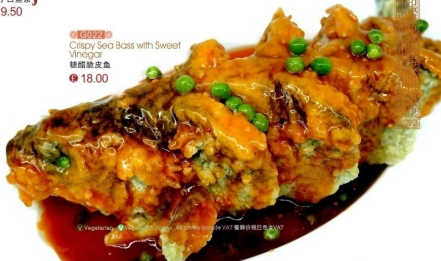
G022 Crispy Sea Bass with Sweet Vinegar 糖醋脆皮鱼 18.00