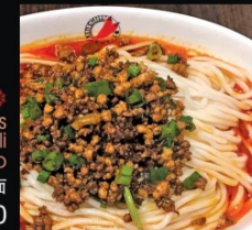
✿ L027 ✿ Sichuan Dandan Noodles with Minced Pork & Chilli Sauce in Soup 四川担担面 € 9.50