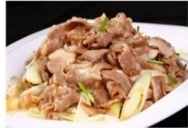
D002 Beijing Hot Wok Sliced Mutton Stir Fried with Spring Onion 京葱爆羊肉 ¥ 9.50