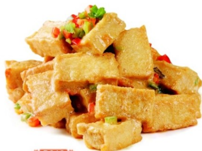
B018 Salt & Pepper Beancurd 椒盐豆腐 £ 5.50