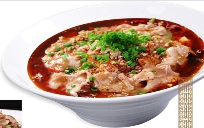
D001 Spicy Hot Poached Mutton in Chilli Oil 水煮羊肉 ¥ 10.50