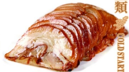
C013 Poached Sliced Deboned Pork's Joint 酱猪肘花 € 6.50