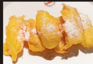
N002 Fried Mixed Sesame & Egg Glutinous Rice (6 pieces) 脆皮锅炸(每份6个) $ 4.50