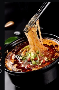
✿ L026 ✿ Sichuan Mung Bean Soup Pastry 四川酸辣粉条 € 8.50