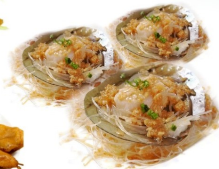
B017 Steamed Scallops in Vermicelli (3 Pieces) 粉丝蒸带子(每份3个) £ 10.50 豆豉/蒜茸/黑胡椒/葱姜 /Crushed Garlic /Black Pepper /Ginger & Spring Onion