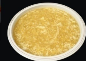
S007 Chicken & Sweet Corn Soup £ 4.50 鸡蓉粟米汤