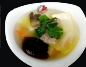
S003 Sliced Pork & Mixed Vegetable Soup £ 4.50 肉片什菜汤