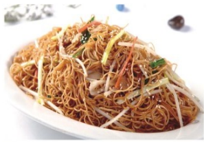
L029 Fried Soft Noodles ( with or without Beansprout) 炒软面 $ 6.50