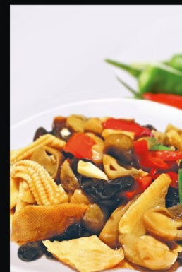
K005 Stir Fried Tofu, Straw Mushroom, Red Pepper, Baby Corn & Black Fungus 葱油烧素烩 ¥ 9.50