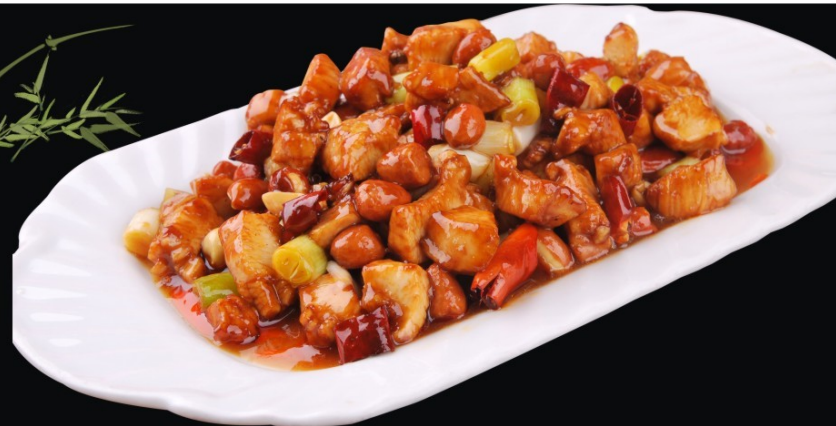
F001 GongBao Diced Chicken with Peanuts & Dried Chilli 宫保鸡丁 $ 9.50