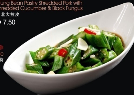
C018 Okra Salad with Crushed Garlic € 6.50 清爽秋葵