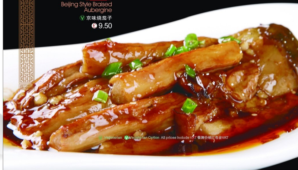
K008 Beijing Style Braised Aubergine 京味烧茄子 ¥ 9.50

Vegetarian Vegetarian Option All prices include VAT 餐牌价钱已包含VAT