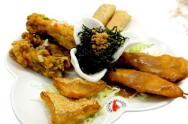
B016 House Special Platter (per person) 招牌拼盘(每位) £ 9.00 两位起用 minimum order for two persons