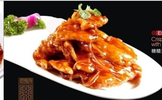
E001 Crispy Fried Pork Tenderloin with Sweet Vinegar 糖醋里脊 ¥ 9.50

Vegetarian All prices include VAT 餐牌價錢已包含VAT