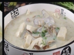
S002 Seafood & Beancurd Coriander Soup 香茜海鲜豆腐汤 £ 5.00