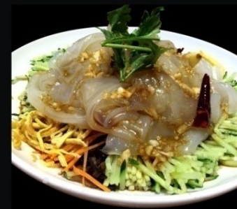
C017 Mung Bean Pastry Shredded Pork with Shredded Cucumber & Black Fungus 东北大拉皮 € 7.50