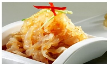
C008 Jelly Fish with Sesame & Crushed Garlic 葱油拌海蜇 € 7.50