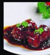
B007 Fillet Steak Rolls (3 pieces) 牛柳卷(每份3条) 7.50 Cantonese Sauce / Black Pepper Sauce / Sweet & Spicy Sauce 中式汁 / 黑椒汁 / 鱼香汁 (请选择其中一种调料)