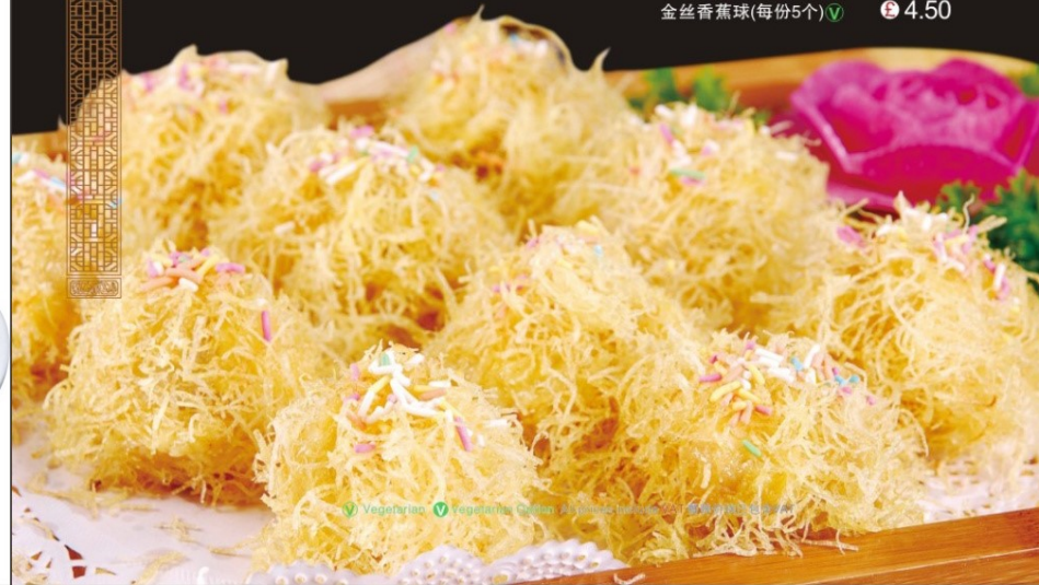
N008 Deep Fried Banana Balls Coated with Golden Shredded Potato (5 pieces) 金丝香蕉球(每份5个) $ 4.50