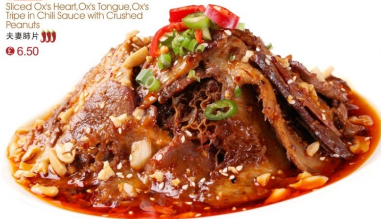
C012 Sliced Ox's Heart, Ox's Tongue, Ox's Tripe in Chili Sauce with Crushed Peanuts 夫妻肺片 € 6.50