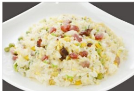
✿ L013 ✿ Diced Chinese Dried Bacon & Chinese Sun-dried Sausage Fried Rice 腊味炒饭 € 10.00