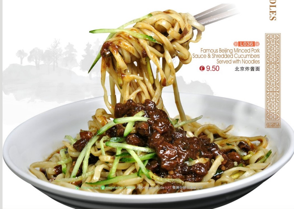
L036 Famous Beijing Minced Pork Sauce & Shredded Cucumbers Served with Noodles 北京炸酱面 $ 9.50

Chicken / Beef / Pork / Duck / Mixed Vegetables 鸡/牛/猪/鸭片/杂菜 on Soft Noodles / Crispy Noodles “配软面/脆面”