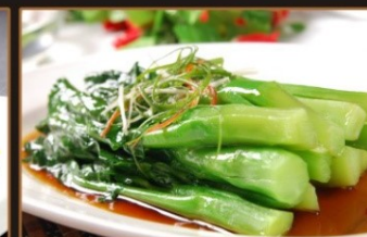
🌿 K019 🌿 Kai Lan 芥蓝 9.50