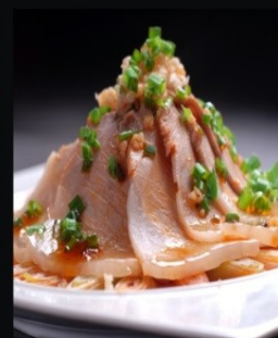
C003 Poached pork Belly with Crushed Garlic in Chili Oil £ 6.50 蒜泥白肉