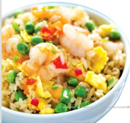
✿ L021 ✿ Jade Fried Rice with Diced King Prawns & Vegetable 翡翠炒饭 € 10.00