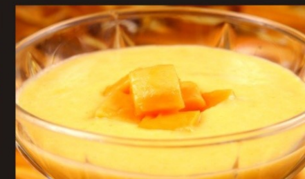
N003 Mango Pudding 芒果布丁 $ 3.80