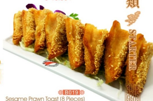
B019 Sesame Prawn Toast (8 Pieces) 虾多士 (每份8块) £ 7.50