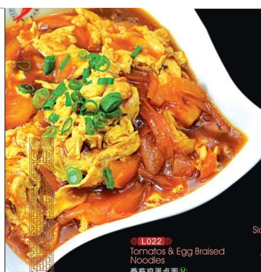
✿ L022 ✿ Tomatoes & Egg Braised Noodles 番茄鸡蛋卤面 € 9.50