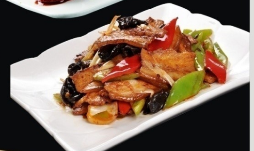
E003 Sauteed Sliced Pork Belly with Chilli 山城回锅肉 ¥ 9.50