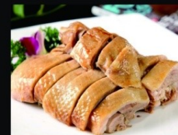
C005 Poached Salted Sliced Duck 盐水鸭 £ 6.50