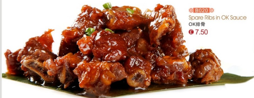
B020 Spare Ribs in OK Sauce OK排骨 £ 7.50