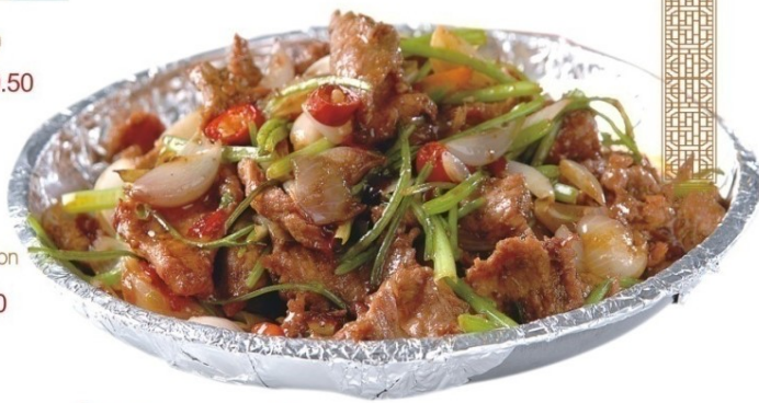
D009 Stir Fried Roast Sliced Mutton with Onion & Coriander 炒烤羊肉 ¥ 9.50