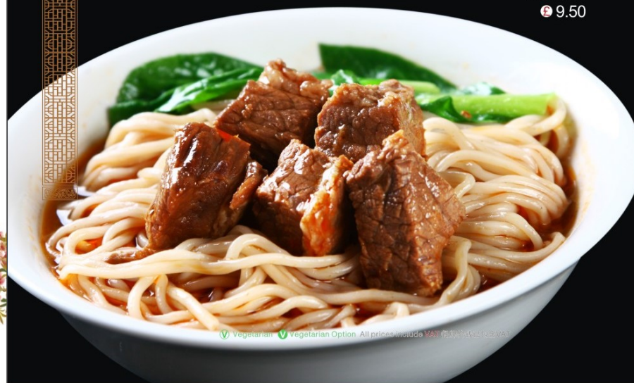
✿ L028 ✿ Braised Beef Belly in Noodles Soup 红烧牛腩面 € 9.50