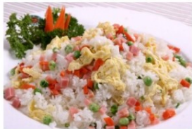
✿ L015 ✿ Diced Ham & Shrimps with Vegetable Fried Rice 什锦炒饭 € 9.50