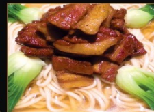
✿ L023 ✿ Beijing Style Braised Pork Belly in Noodles Soup 北京小肉面 € 9.50