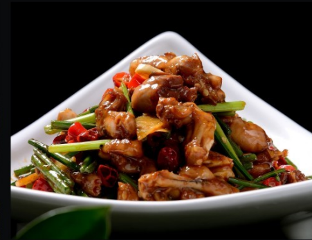
I002 Stir Fried Frog's Leg in Old Grandma's Chilli Sauce 老干妈酱炒田鸡腿 9.50