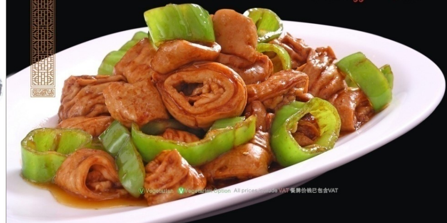
E006 Spicy Pig's Intestines 辣子圈圈肠 ¥ 9.50