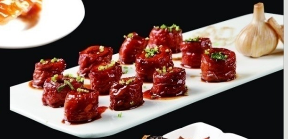
E002 Pig's Intestines in Brown Sauce 九转大肠 ¥ 9.50