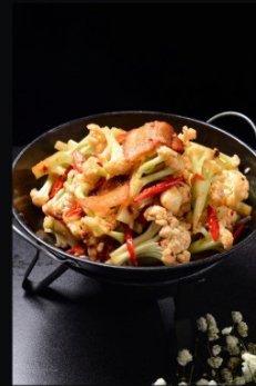
I001 Dry Braised Pork Belly with Cauliflower 五花肉干锅菜花 9.50