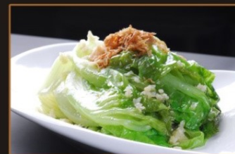
🌿 K020 🌿 Iceberg Lettuce 卷心生菜 9.50