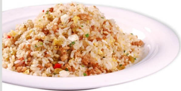
✿ L017 ✿ Minced Pork & Beancurd Fried Rice 豆腐肉碎炒饭 € 9.50