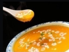
S005 Pumpkin Seafood Soup 南瓜海鲜羹 £ 5.00