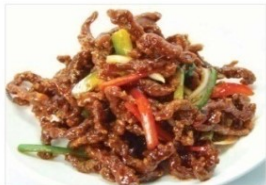
D005 Crispy Shredded Beef in Cantonese Sauce 西式炸牛柳丝 ¥ 9.50