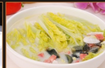
🌿 K021 🌿 Chinese Cabbage 白菜 9.50