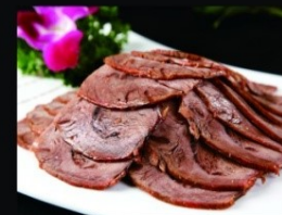
C006 Five Spice Sliced Beef 五香牛肉 £ 6.50