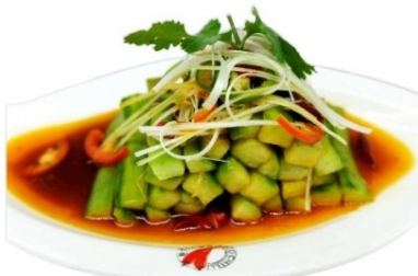
C009 Beijing Style Crispy Stripped Cucumber 京脆瓜条 € 5.50