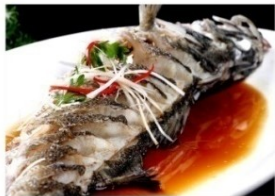
G016 Steamed Sea Bass with Soy Sauce 清蒸鲈鱼 18.00