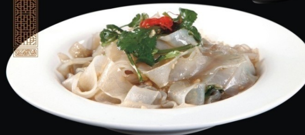
C019 Mung Bean Pastry Salad 凉拌粉皮 € 5.50

Vegetarian All prices include VAT 餐牌價錢已包含VAT