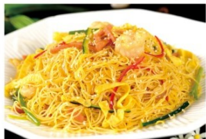
L030 Singapore Style Vermicelli with Ham & Shrimps 星洲炒米粉 $ 9.50