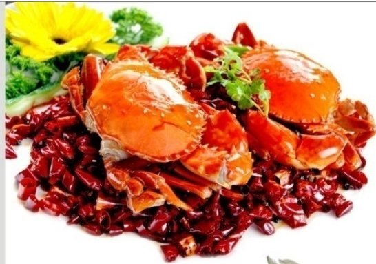
G013 Sauteed Crab in Hot Spicy Sauce 香辣蟹 12.00