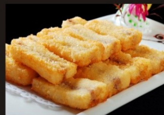
N001 Egg & Glutinous Rice Cakes 蛋煎糍粑(每份3个) $ 4.50