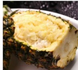
✿ L020 ✿ Pineapple Fried Rice 菠萝炒饭 € 9.50