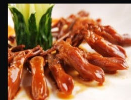
C007 Duck's Tongues in Seasonal Soy Sauce with Shredded Cucumber 卤水鸭舌 £ 7.50