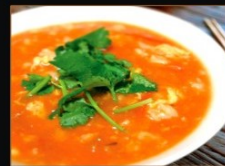
✿ L025 ✿ Beijing Style Famous Cooking Style Eggs, Tomatoes & Parsley in Soup 老北京疙瘩汤 € 6.00