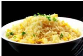
✿ L016 ✿ Egg Fried Rice 鸡蛋炒饭 € 3.30