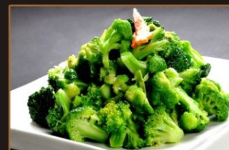
🌿 K018 🌿 Broccoli 西兰花 9.50