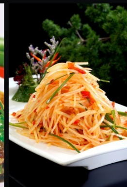
K006 Sauteed Shredded Potato with Slice Red Chilli 尖椒土豆丝 ¥ 8.50