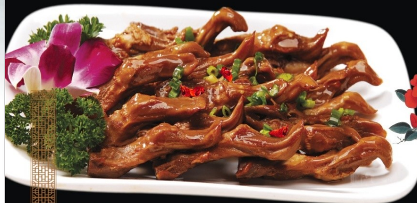
C001 Hot & Spicy Duck Tongues £ 7.50 麻辣鸭舌