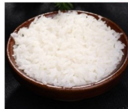
✿ L019 ✿ Jasmine Boiled Rice 飘香白饭 € 2.30