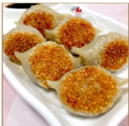
L001 Pan Fried Mince Pork Dumplings with Sesame, Spring Onion & Ginger (6 pieces) 青岛芝麻煎饺(每份6个) ¥ 5.80