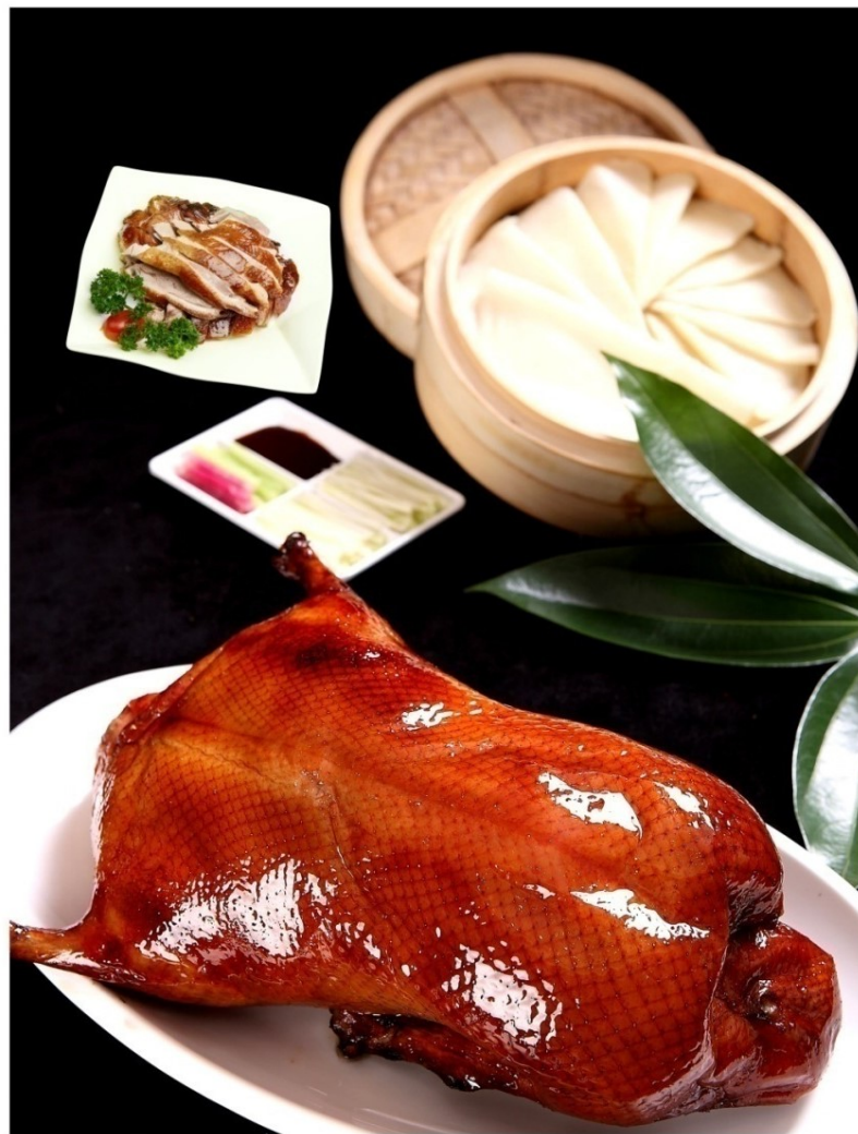
Beijing Roasted Duck Served with Pancakes, Shredded Cucumber, Spring Onion and Hoi-sin Sauce. 北京烤鸭