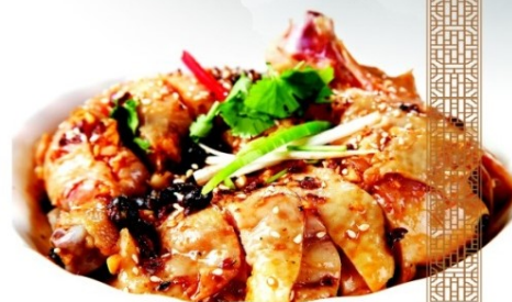
C010 Home-Made Style Chicken 家乡口水鸡 € 7.50